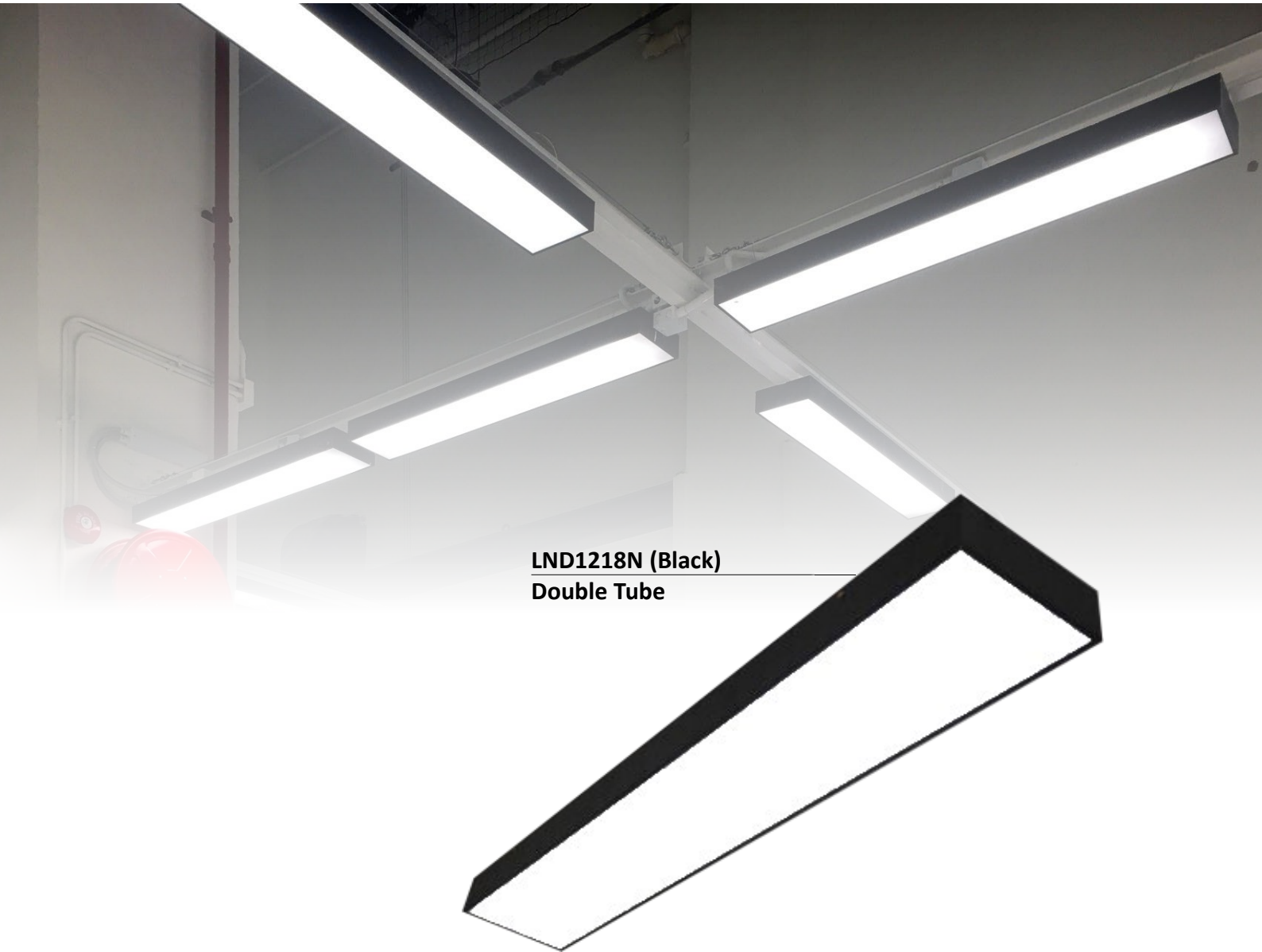
LND1218N (Black) Double Tube